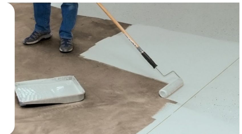
PU Concrete | PU Roller Coat

PU, Solvent as well as water based top coating system designed for application in Automobile Engineering, Chemical, Steel, Textile, Food and Pharma Floors.